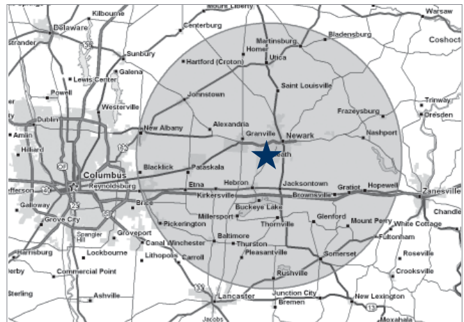
★ Indian Mound Mall Trade Area Radius: 20 Miles